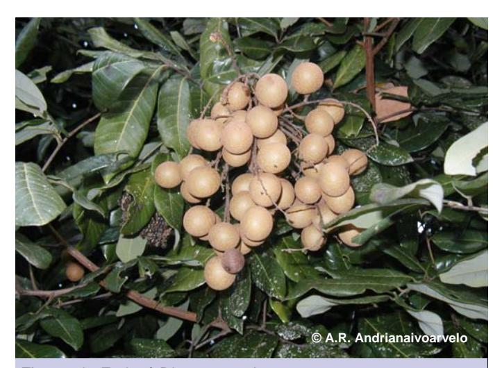
Figure 1b: Fruit of Dimocarpus longan