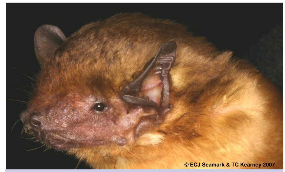
Above: Lactating female Yellow house bat, Scotophilus dinganii (A. Smith, 1833), caught in Marloth Park, South Africa, 3 January 2007 (field number SMG-15772).